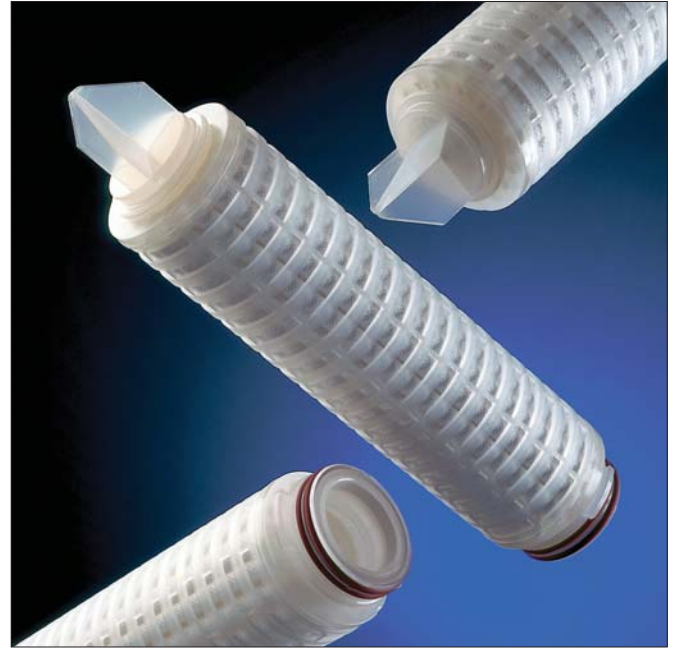
Profile Star Filter Cartridges

Please refer to the Pall website www.pall.com/foodandbev for a Declaration of Compliance to specific National Legislation and/or Regional Regulatory requirements for food contact use.